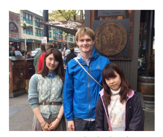
Learning Portland culture!