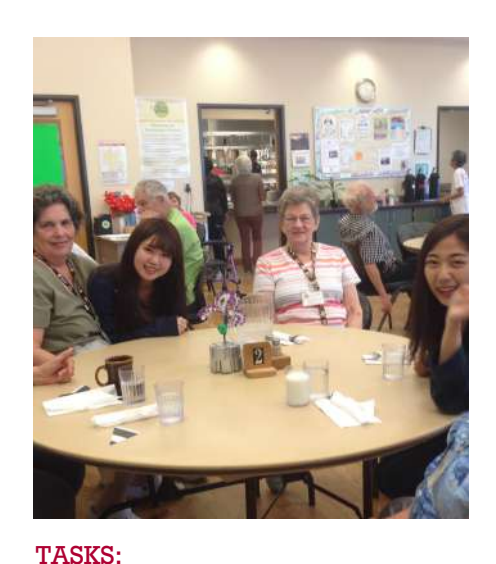
Prepare and serve meals to seniors and talk with them