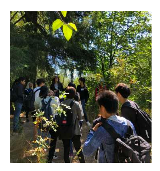
TASKS: Help with park projects with