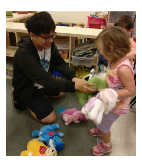
TASKS: Work with youth in various education and environmental activities