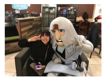
Meeting the WPU mascot!